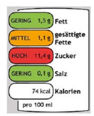
A comparative nutrition label that employs stoplight color-coding.

The figure shows a comparative nutrition label proposed by FoodWatch, a German NGO. The nutritional items categorized by the stoplight color-coding are fat, saturated fat, sugar, salt, and calories. Numerical values are also given. The connotations of the colors are further interpreted by the text (interpretive aids) "Gering" for low, "Mittel" for moderate, and "Hoch" for high.