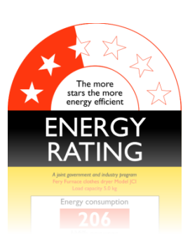
FIGURE 3. AN EXAMPLE OF THE AUSTRALIAN ENERGY RATING LABEL USED PRIOR TO OCTOBER 2000 AND THE PRESENT DESIGN [14].

The second group comprising our audience consists of managers and planners of new labeling programs and programs that are being re-evaluated. For example, when Walmart decided to devise a labeling program to rate large numbers of products on environmental and social sustainability over the course of the products' lifecycles, Walmart turned to several organizations, including the Environmental Defense Fund and the Applied Sustainability Center at the University of Arkansas School of Business [15]. In projects such as this nondesigners almost certainly collaborate with designers in various ways and, in particular, are apt to have the final say over which designs will be used. LabelPatterns.org can help managers and planners with the communicative dimensions of a labeling program.